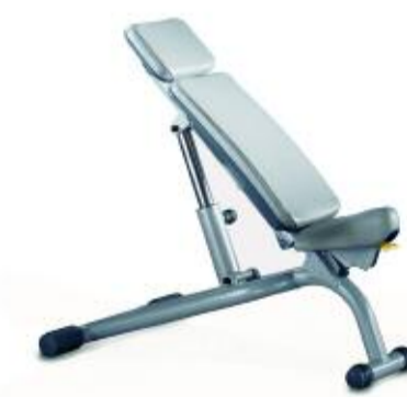
PA04 4 USES BENCH