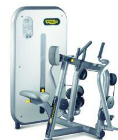
MA950 LOW ROW