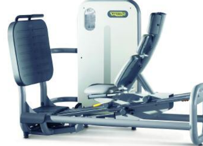
MA500 LEG PRESS