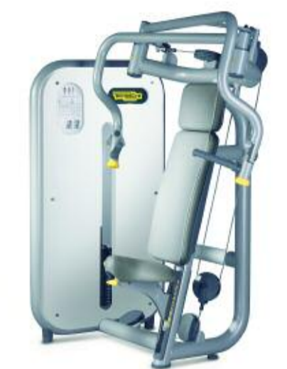
MA200 CHEST PRESS