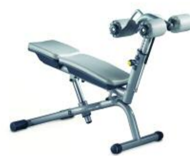
PA03 CRUNCH BENCH