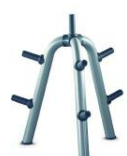
A0000231 DISK RACK