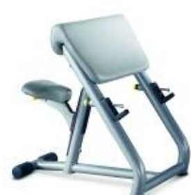
PA06 SCOTT BENCH