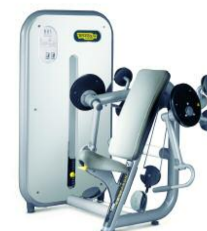
MA550 ARM CURL