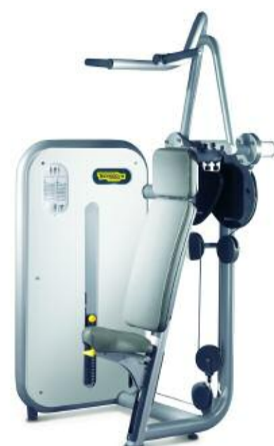
MA250 VERTICAL TRACTION