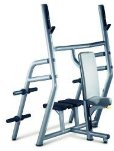
PA02 VERTICAL BENCH