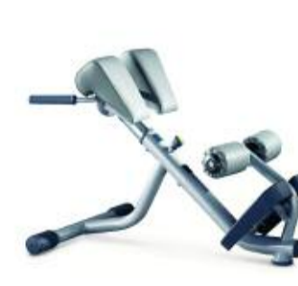
PA05 LOWER BACK BENCH