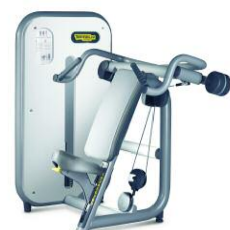
MA150 SHOULDER PRESS