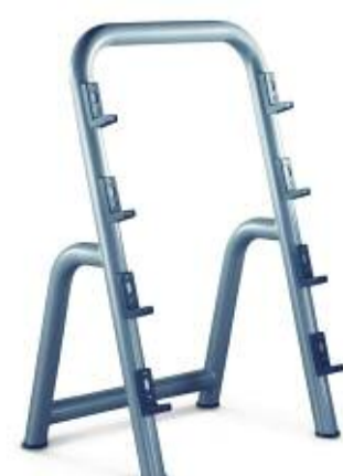
A0000230 BARBELL RACK