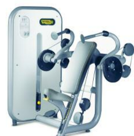
MA600 ARM EXTENSION