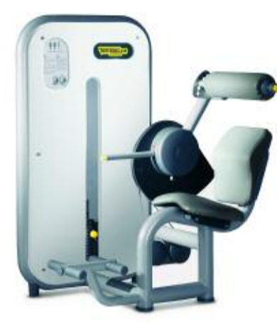
MA450 LOWER BACK