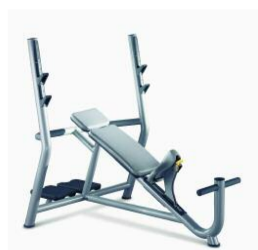
PA01 INCLINED BENCH