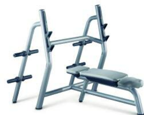
PA07 HORIZONTAL BENCH