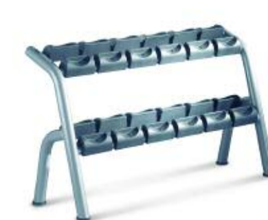
A0000278AA DUMBBELL RACK