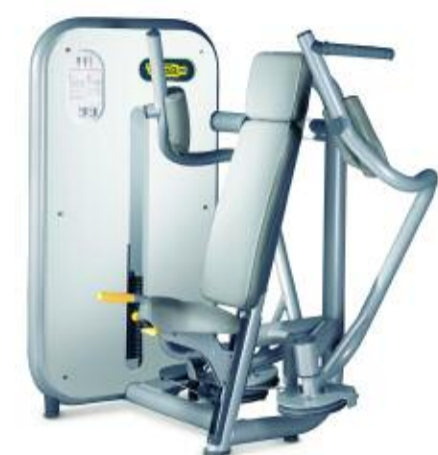
MA700 PECTORAL MACHINE