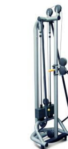
MA900 ERCOLINA REHAB