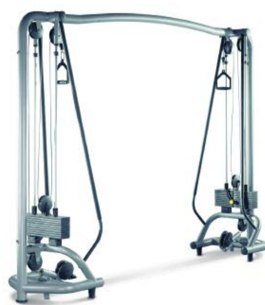
MA850 CROSS OVER CABLE