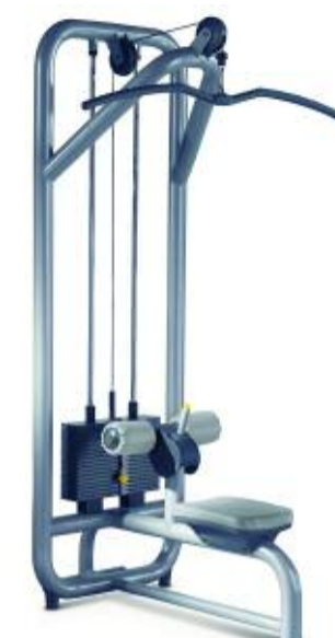
MA400 LAT MACHINE