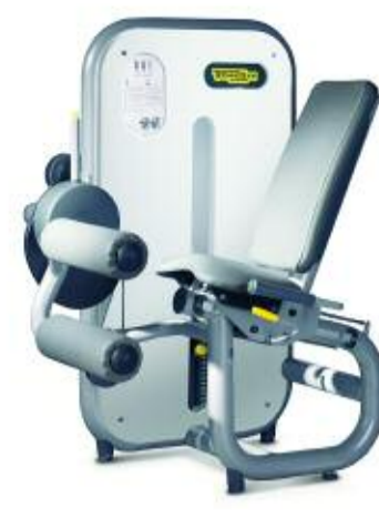
MA350 LEG CURL