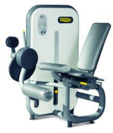
MA300 LEG EXTENSION