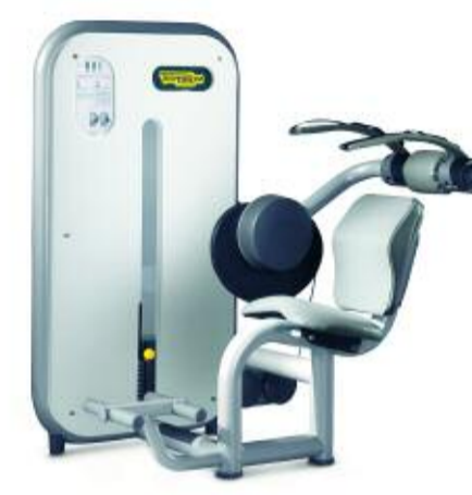
MA650 ABDOMINAL CRUNCH