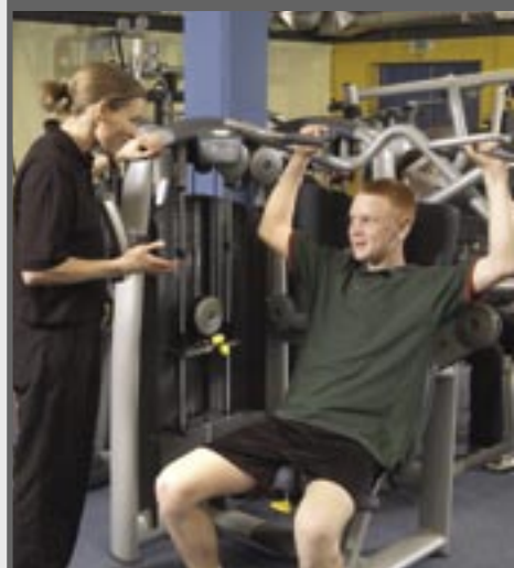
Sharnbrook School - UK