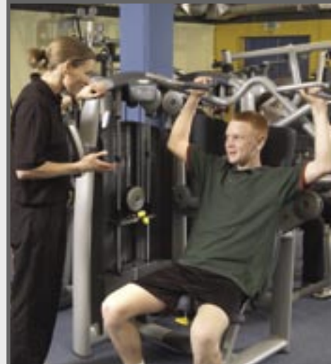
Sharnbrook School - UK