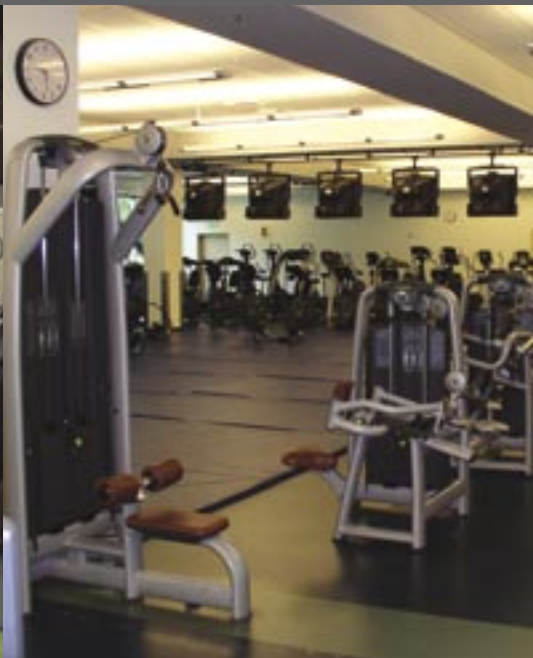
University of Washington - USA