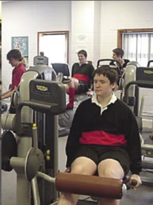
Sleaford Carres Grammar School - UK