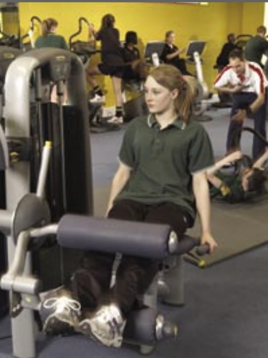
Sharnbrook School - UK