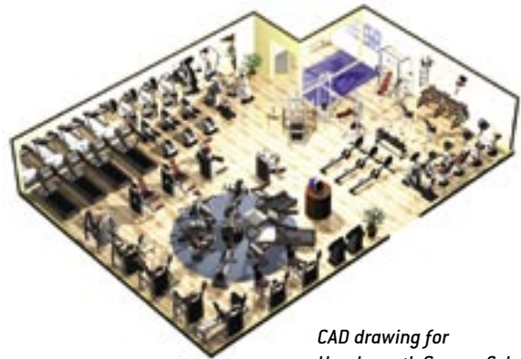
CAD drawing for Handsworth Grange School

In order to create an atmosphere conducive to exercising and learning, design should create a stimulating, familiar environment in which to work out. Technogym® provides advice on the best usage of space and equipment layout. 2D technical drawings and 3D computer generated visuals with animated ‘walk-throughs’ can be supplied at an early stage to help with the planning process. Design consultants are also on-hand to provide valuable input into all aspects of facility safety and accessibility.