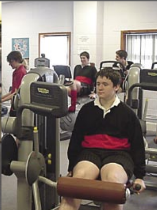
Sleaford Carres Grammar School - UK