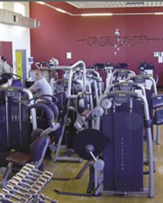
Loughborough University - UK