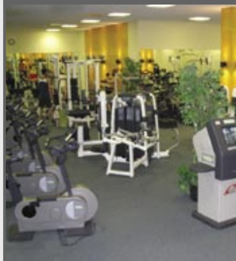
University of Hamburg - Germany