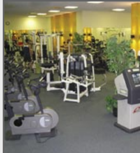
University of Hamburg - Germany