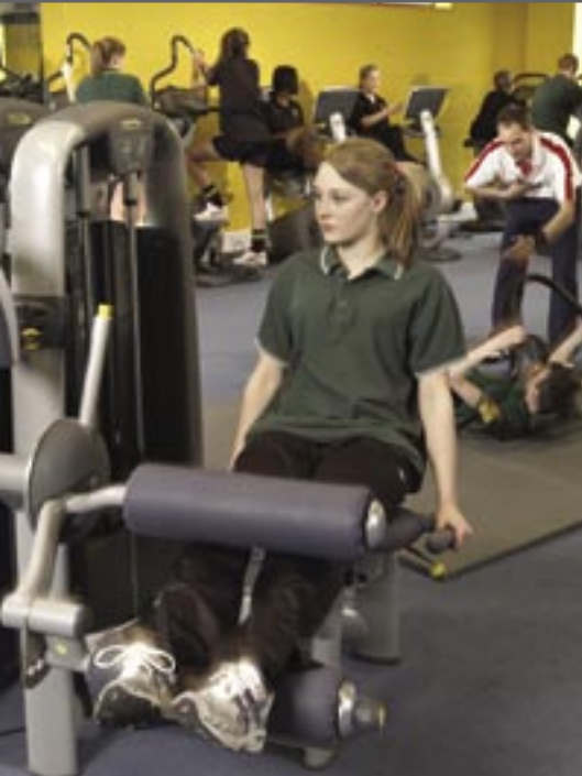
Sharnbrook School - UK