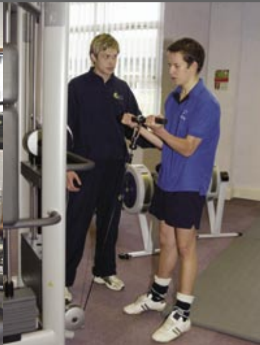
Handsworth Grange - UK