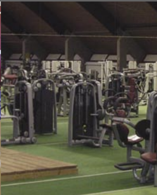
Kiel University - Germany